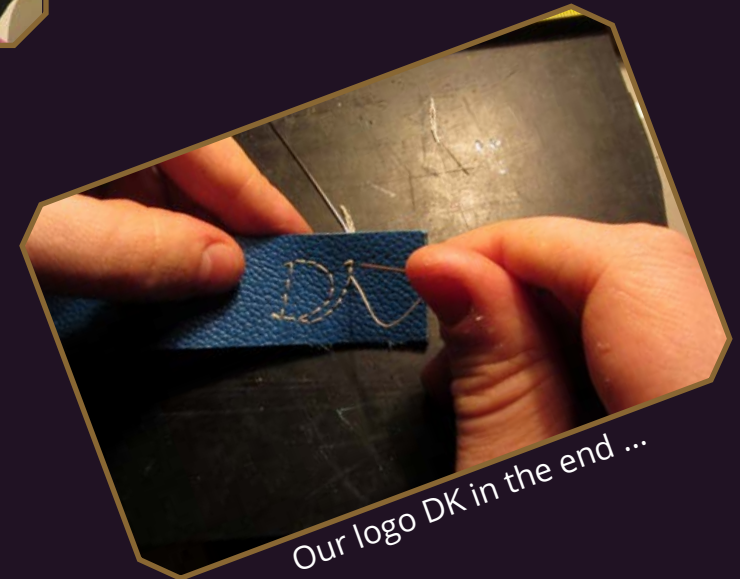
Our logo DK in the end ...