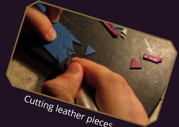
Cutting leather pieces ...