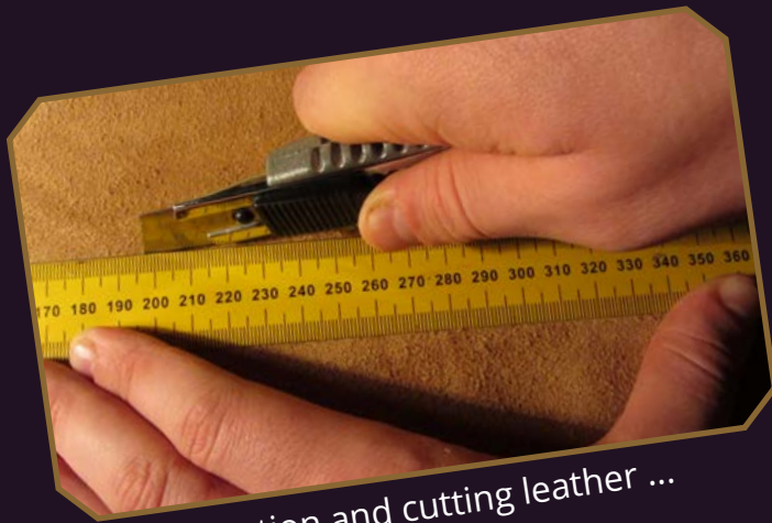
Preparation and cutting leather ...