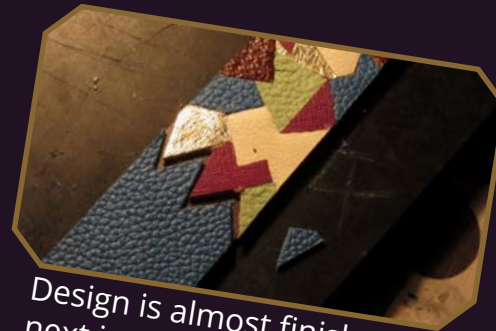
Design is almost finished, next is stitching ...