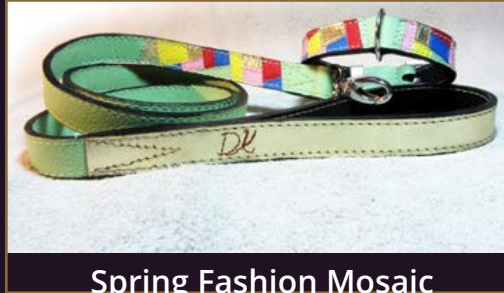
Spring Fashion Mosaic

Hand Made leather dog collar, dog lead and set (Ref.num.: dk3)