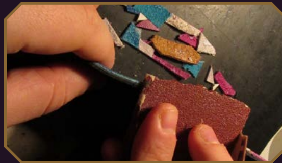
Leather collar sanding ...