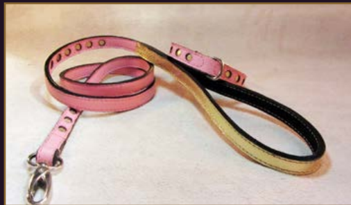
Magic night in Paris

Hand Made leather dog collar, dog lead and set (Ref.num.: dk6)