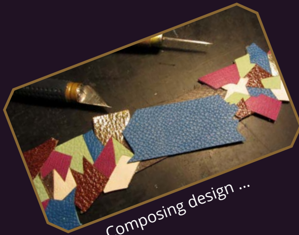
Composing design ...