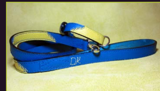
Dreaming of summer

Hand Made leather dog collar, dog lead and set (Ref.num.: dk6)